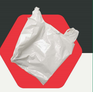
No loose plastic bags and no bagged recyclables.

Remember these three simple rules each time you recycle: