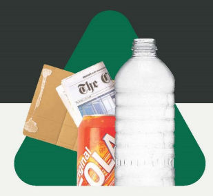
Recycle clean bottles, cans, paper and cardboard